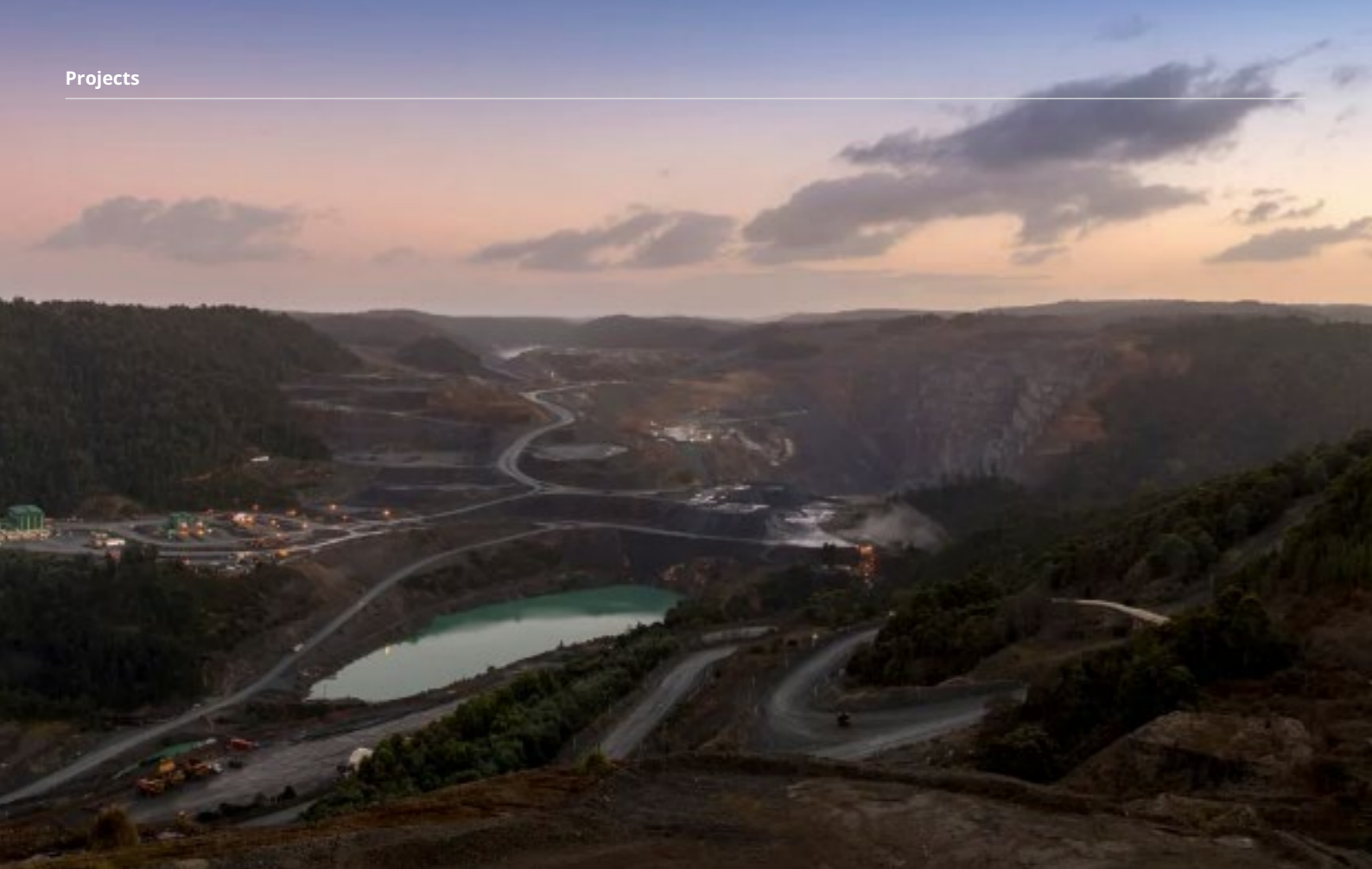
Image: Savage River Iron Ore Mine, Tasmania.