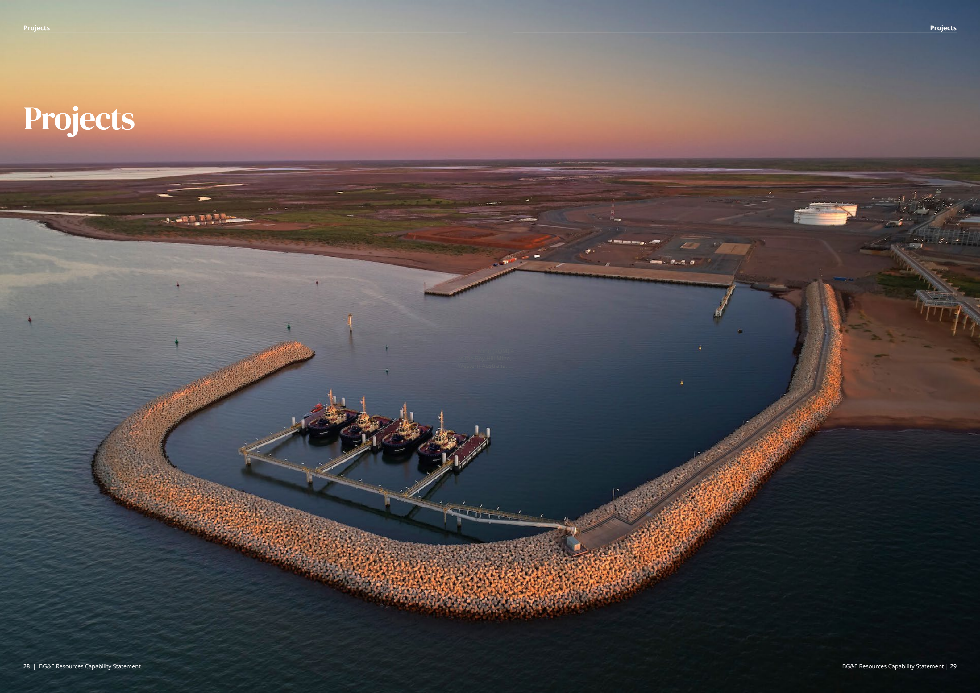
Port of Kings (POM) 4 at The Roy Hill Mine, Western Australia.