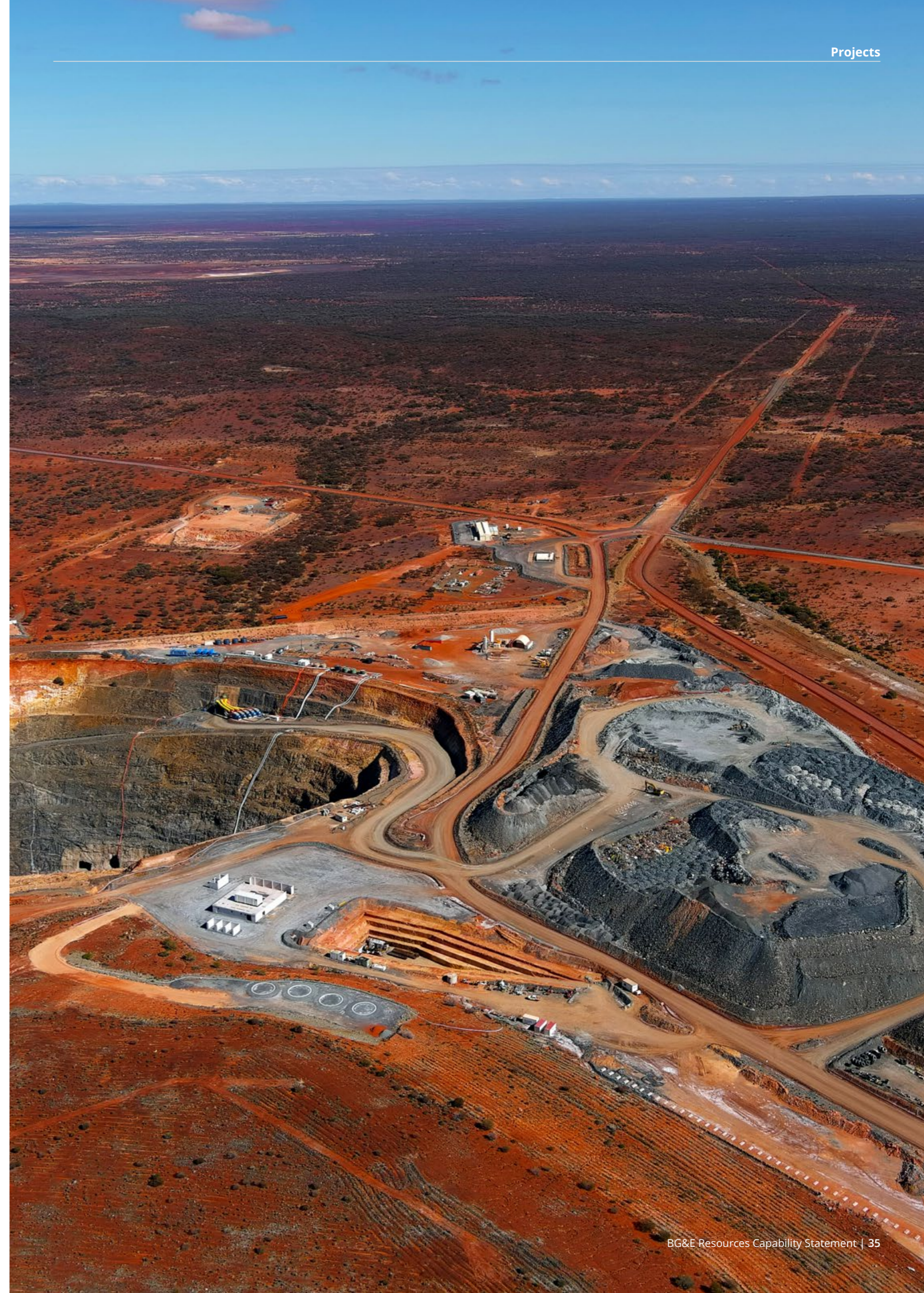
Image: IGO Cosmos Nickel Mine, Western Australia.

On the ground, our civil engineering professionals were involved in developing the LV and HV access road design for the NPI area. We also supplied secondment personnel to fulfil superintendent, project engineering and quality management roles.